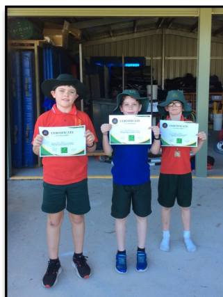
10yrs Age Champions