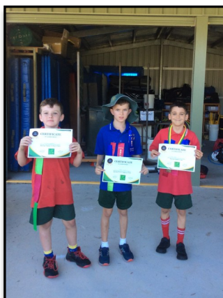
9yrs Age Champions