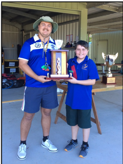
Spirit Award Tasman