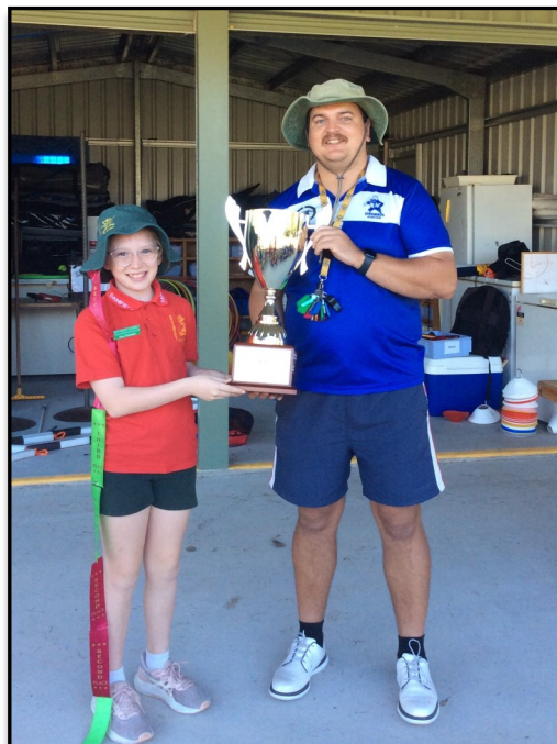
Overall Points Dampier