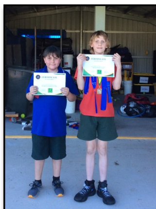
12yrs Age Champions