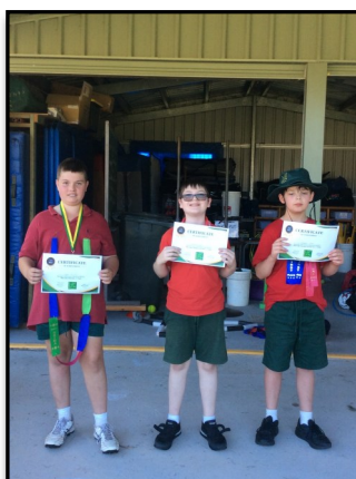
11yrs Age Champions